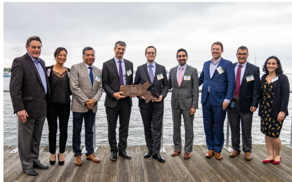
Mass General Brigham leads on climate

In recognition for its achievement and innovation in health care sustainability, Mass General Hospital received the 2022 Circles of Excellence Award in the categories of Leadership and Climate from Practice Greenhealth, the nation's leading organization dedicated to environmental sustainability in health care. ( Read full story )